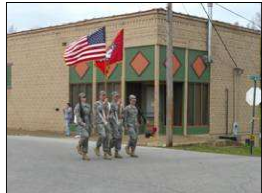
ROTC Honor Guard