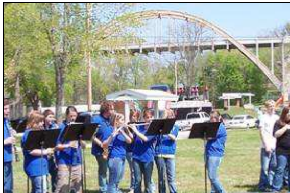
Cotter Band and Choir