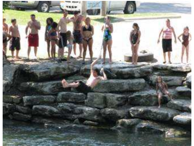
This youngster gathered his courage before taking a plunge from the mermaid rock at Big Spring Park. It won't be long before he joins the big kids and adults flipping from the rope swing.