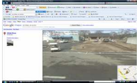
maps.google.com web page